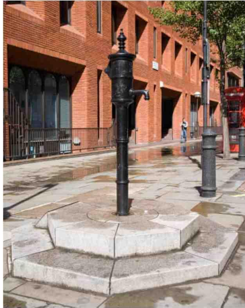
Broad Street Pump in Soho, London.

My first object is the Broad Street Pump in Soho, London. This object represents how the accumulating historical development of scientific knowledge has shaped our current knowledge of public health. The handle of this pump was removed by British physician John Snow ( Lusignan, Carlyon and Lalvani, 2020 ), considered the founder of epidemiology, during a severe cholera outbreak which killed over 23,000 ( web.archive.org, 2008 ) in Britain during the 1853-54 epidemic. Snow methodically mapped cholera deaths and traced the source of the disease to this Pump which had been contaminated by a leaking cess pit upstream ( Past Medical History, 2018 ). Consequently, this object represents the scientific memory that means that London fared much better during the next cholera breakout (with under 4,000 deaths ( Luckin, 1977 )) due to its improved sewage systems and clean water ( Museum of London, 2019 ).