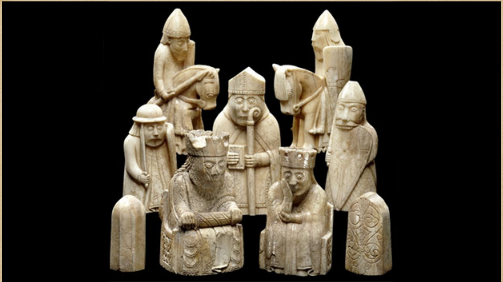
The Lewis Chessmen (Norway, 12th Century)